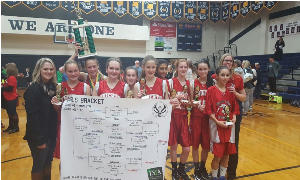
The Sacred Heart Middle School girls' basketball team won the St Paul tournament in Eugene. It was a tournament with 7 Catholic schools. It was the first time the girls won in over 10 years. Congratulations Sacred Heart!!!

PARISH OFFICES AND CENTER - 517 W. 10 th ST. * PHONE 541-779-4661, FAX 541-774-9474 WWW.SACREDHEARTMEDFORD.ORG PARISH CHURCH - 10TH AND SOUTH OAKDALE * MEDFORD, OREGON 97501