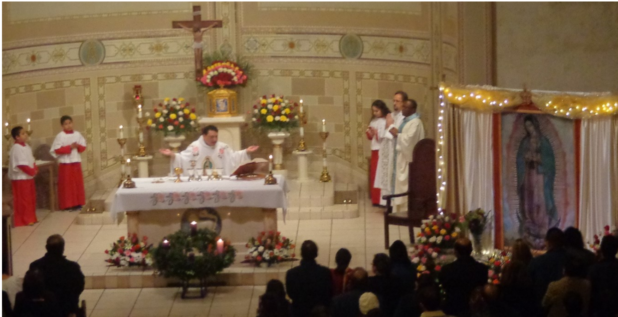
Feast of Our Lady of Guadalupe, December 12, 2016 at Sacred Heart Church

PARISH CHURCH - 10TH AND SOUTH OAKDALE * MEDFORD, OREGON 97501